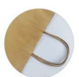
Brown Twisted PP Handle