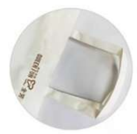
Flat Paper Handle