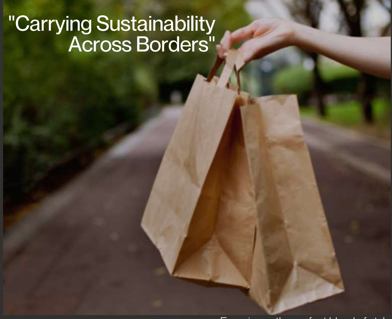
Experience the perfect blend of style and comfort today!