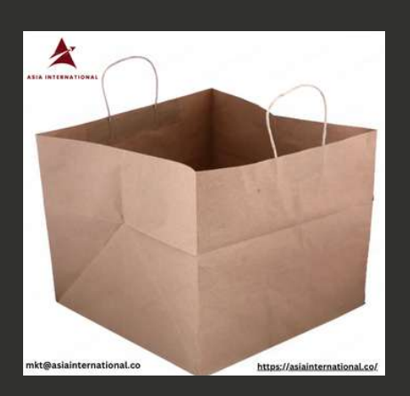
EXTRA LARGE PAPER BAG WITH HANDLE