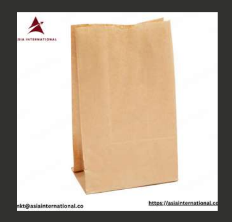
KRAFT PAPER BAG WITHOUT HANDLE