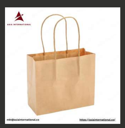
KRAFT PAPER BAG WITH HANDLE