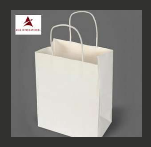
WHITE KRAFT PAPER BAG