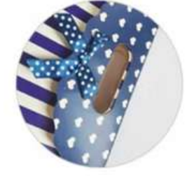
Ribbons Bows Handle