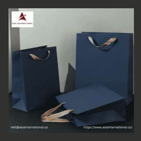
KRAFT PAPER SHOPPING BAG