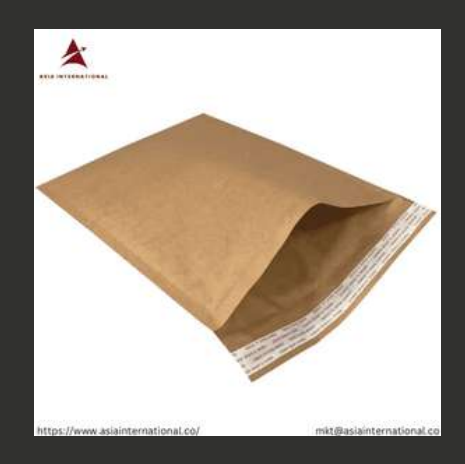
KRAFT PAPER ENVELOPE